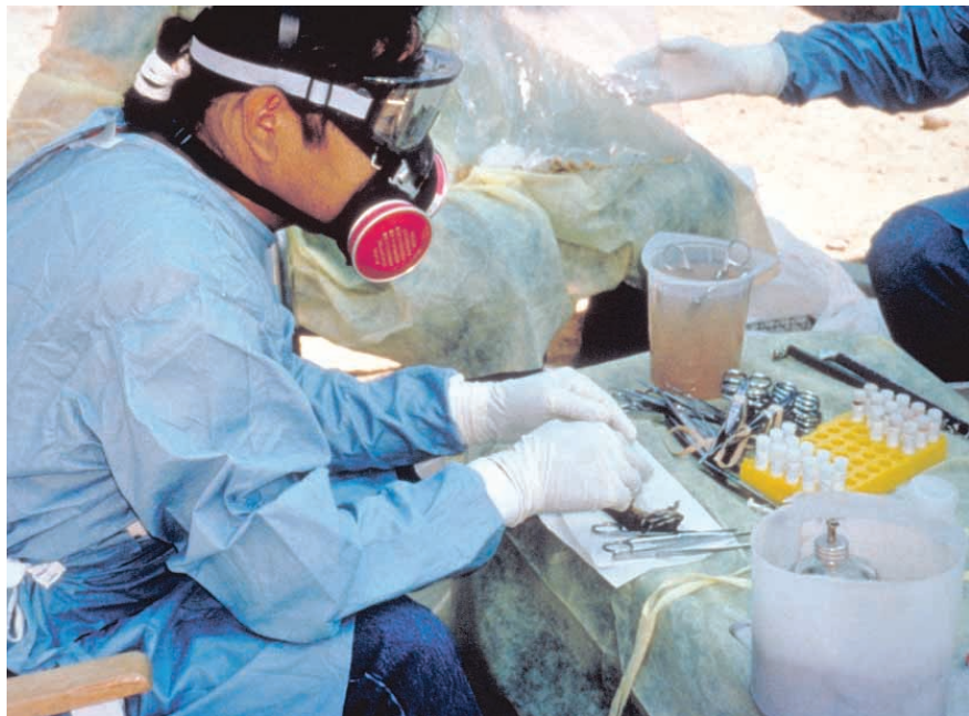
Testing for hantavirus in wild populations of deer mice, a CDC scientist collects specimens from rodents trapped in a field study. The LTER network played a major role in making it possible to track down the source and spread of the hantavirus by sampling a large number of rodents quickly. NEON supporters say NSF’s massive proposed network would make interdisciplinary collaborations on short notice even easier and more efficient.

better documented and defined than ever. “Hopefully in the white paper we will have described it well enough that people can start to really understand what it is that NEON is supposed to be,”